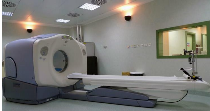
Figure 2: PET/CT VCT scanner at UTV.

for clinical ^{18}\text{F} in the industry, High NECR for both low-count and high-count rate radioisotopes such as ^{68}\text{Ga} , ^{11}\text{C} , ^{82}\text{Rb} and more, optimized for oncology practices administering ^{18}\text{F} , which accounts for nearly 94 percent of all PET procedures, up to 75 kcps at 2.4 kBq/mL, largest axial field-of-view coverage in the industry at up to 26 cm, thorax respiratory Motion Free study can be achieved in as fast as four minutes, full organ imaging in the fewest possible bed positions with one-third scan time, 50-slice equivalent CT speed with IQE 1.75 pitch booster, 20 mm CT coverage for fast exams and short breath holds, platform compatible with advanced digital solutions designed to connect machines, people and data through a portfolio of healthcare analytics applications.