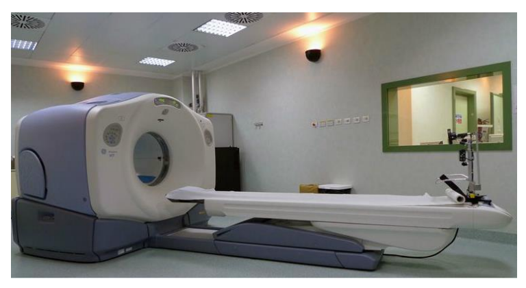
Figure 2: PET/CT VCT scanner at UTV.

for clinical 18F in the industry, High NECR for both low-count and high-count rate radioisotopes such as 68Ga, 11C, 82Rb and more, optimized for oncology practices administering 18F, which accounts for nearly 94 percent of all PET procedures,up to 75 kcps at 2.4 kBq/mL,largest axial field-of-view coverage in the industry at up to 26 cm, thorax respiratory Motion Free study can be achieved in as fast as four minutes, full organ imaging in the fewest possible bed positions with one-third scan time, 50-slice equivalent CT speed with IQE 1.75 pitch booster, 20 mm CT coverage for fast exams and short breath holds, platform compatible with advanced digital solutions designed to connect machines, people and data through a portfolio of healthcare analytics applications.